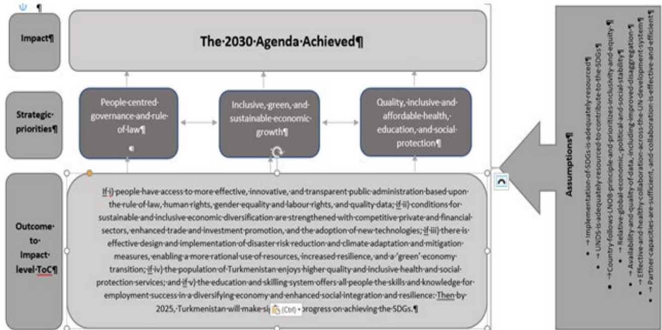
Figure 1: Cooperation Framework Theory of Change

27. An analysis of the assumptions across the outcomes and in the overarching theory of change provides the following set of critical assumptions in relation to the Cooperation Framework: i) Implementation of SDGs is adequately resourced; ii) The UN development system is adequately resourced to contribute to the SDGs; iii) The Government acknowledges 'leave no one behind' principle and prioritizes inclusivity and equity; iv) Relative global economic, political and social stability; v) Availability and quality of data, including improved disaggregation; vi) Effective and healthy collaboration across the UN development system; and vii) Partner capacities are sufficient, and collaboration is effective and efficient.