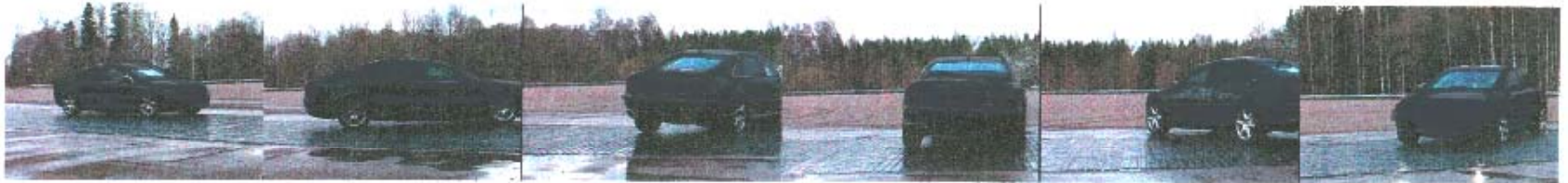
Fig. 2. Vehicle of the same manufacturer, version with increased mass (40...100% higher than mass of a regular production vehicle shown on the Fig. 1), braking from speed 50 km/h, angle of vehicle rotation was 720 degrees. The not expected results of the vehicle with increased mass led to the conclusion about incomplete compatibility of auxiliary systems intended to ensure vehicle stability.