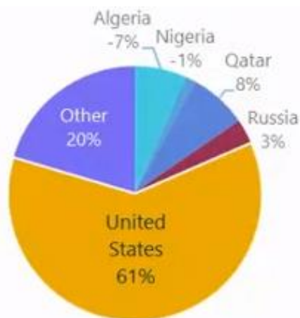
Figure III Incremental European LNG imports in 2022