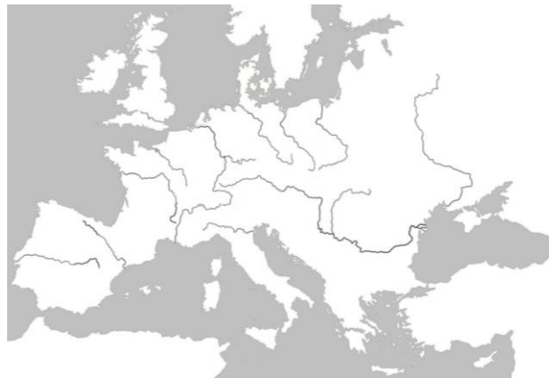
Figure 4 Outlines of Europe