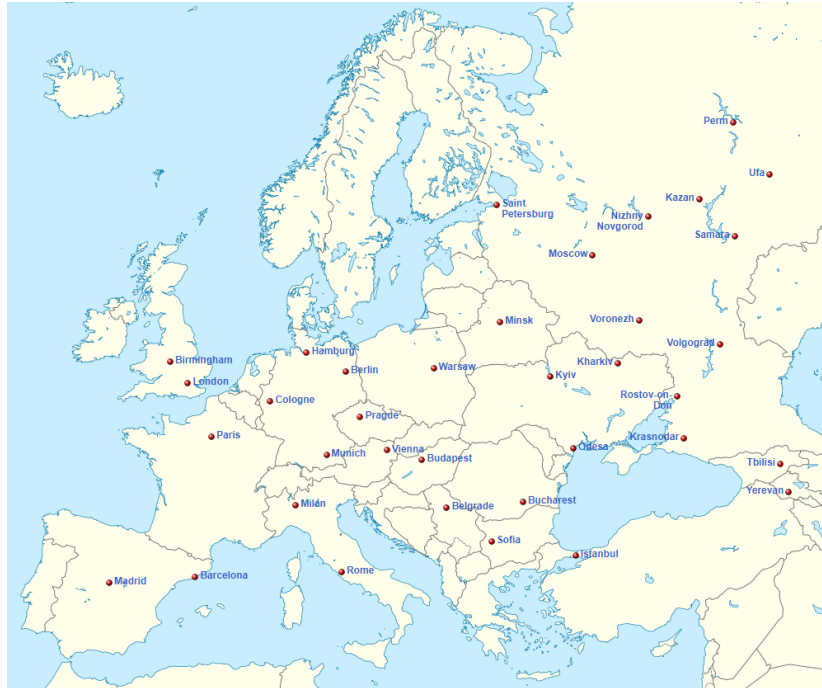
Figure 1 Europe's largest cities

Question 3: Are there procedures in progress whose task is to map the expected changes in the largest cities?