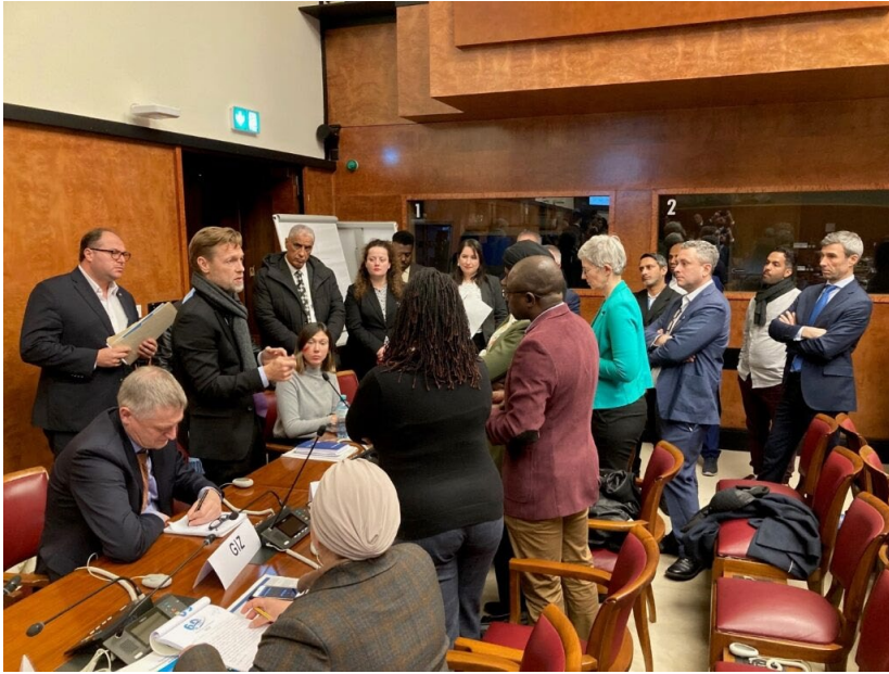
Market place at the Global workshop