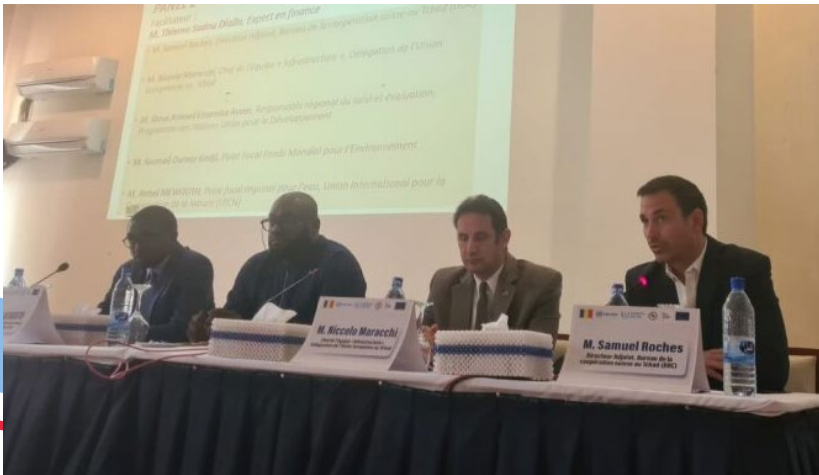
PTFs at the Chad validation workshop